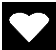
Finished Dark Block Make (6)

Machine appliqué around the heart. Use a tear-away stabilizer if desired, following the manufacturer's directions.